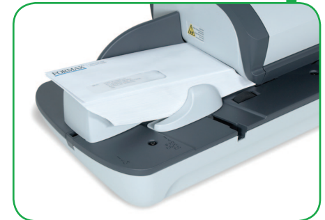
Top-loading Automatic Feeder (210A) processes up to 110 envelopes/minute