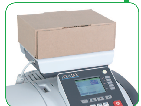
5 lb weighing platform