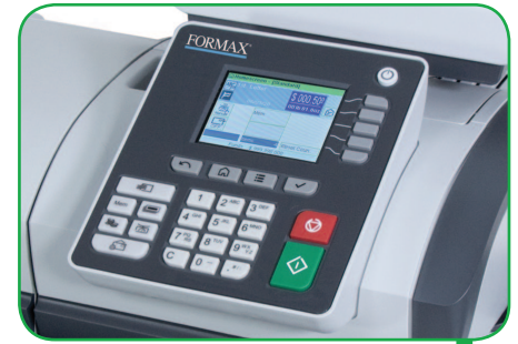
Color screen and shortcut keys for easy navigation and efficient mail processing