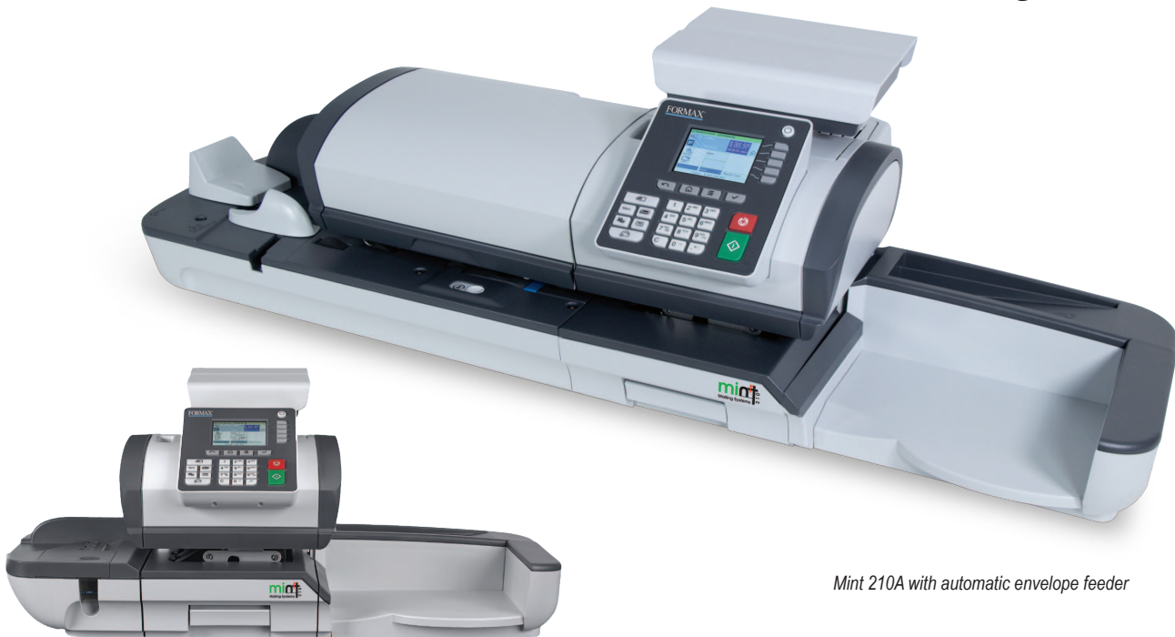
Mint 210A with automatic envelope feeder