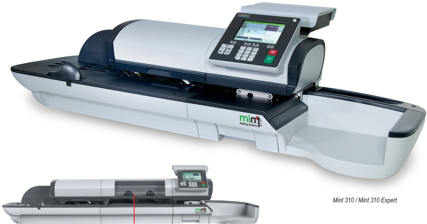
Mint 310 / Mint 310 Expert

System shown with optional dynamic scale