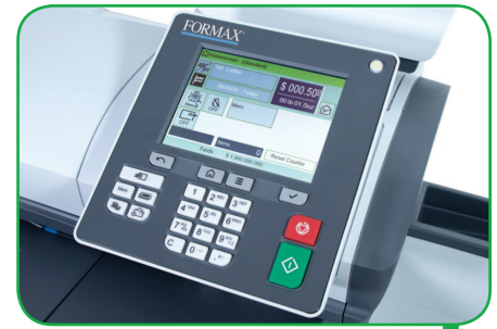
Color touchscreen and shortcut keys for easy navigation and efficient processing