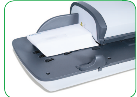
Top-loading Automatic Feeder processes up to 140 lpm / 175 lpm